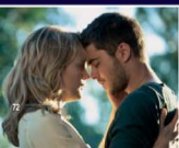
At 24, Zac (above) is already used to life in the public eye and has had to grow up fast in Hollywood. His latest role in romantic drama The Lucky One (left) is a far cry from his days as the teen star of High School Musical (below)