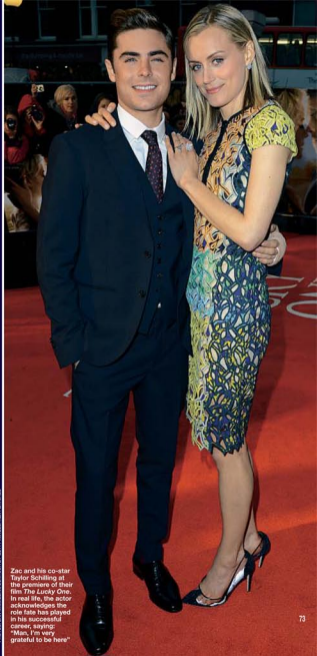
Zac and his co-star Taylor Schilling at the premiere of their film The Lucky One . In real life, the actor acknowledges the role fate has played in his successful career, saying: "Man, I'm very grateful to be here"

The Lucky One is in UK cinemas from 2 May.